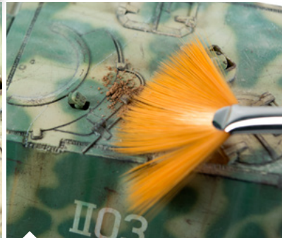
With the Fan Shape brush spread the pigment in the desired areas.