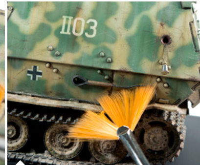
Remove the excess pigments softly and controlling the effect.