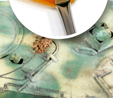
Place a little of dry pigment.