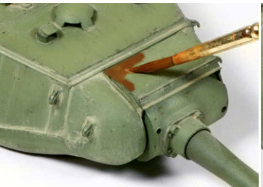
Apply the Crusted Rust deposit in one or more layers in the desired areas of your model.