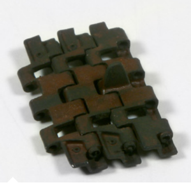
This product has numerous possibilities depending on your taste and the effects you want to achieve. The intensity depends on the number of layers you apply.