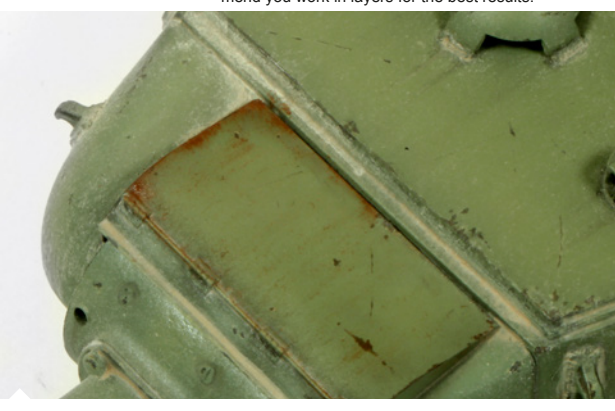
Because of the light texture of the paint you can easily achieve crusted rust effects.