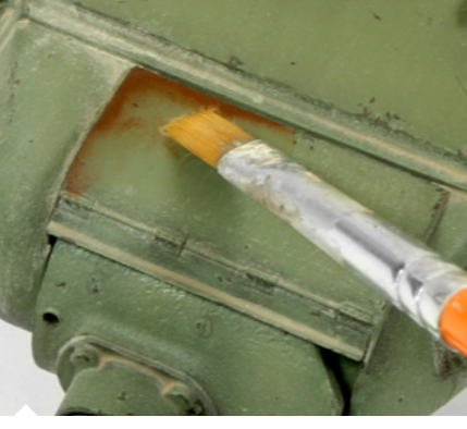
After the paints is almost dry, use a flat moist brush and push the paint in place.