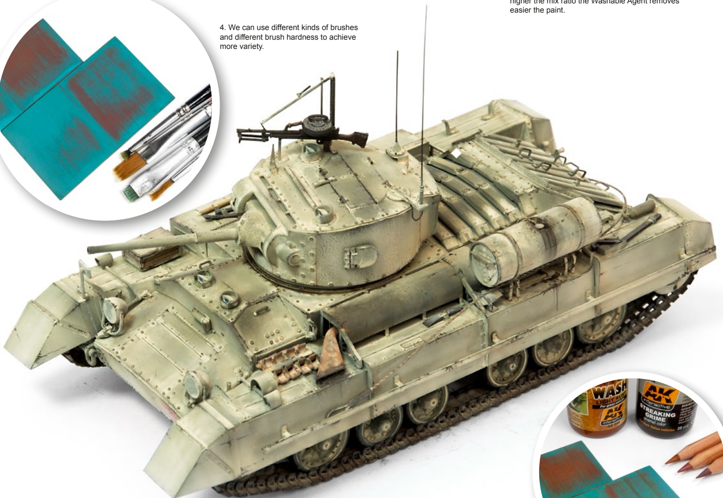
Model by Abilio Pifeiro