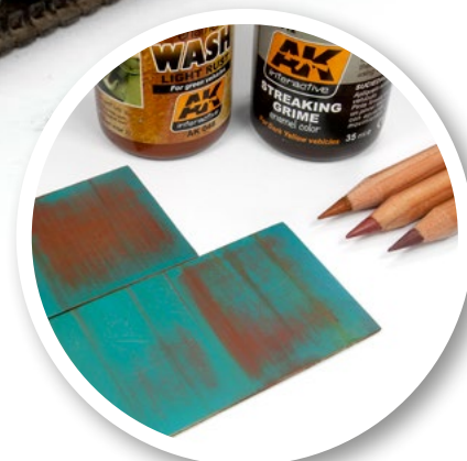
5. The paint is still very resistant to weathering effects and White Spirit.