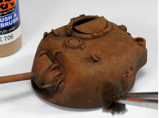
With lighter rust colors and a small piece of foam apply the paint to create a dots to generate some texture.