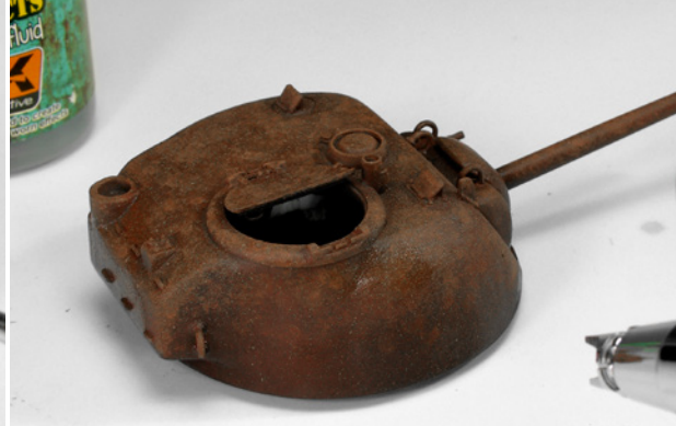
Airbrush the product directly from the jar. If needed, give a couple of coats allowing to dry between them. The product dries in very few