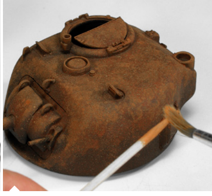
We add some more dots with the lighter rust color of the set and stick technique.