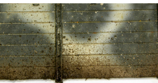
Final result after adding some AK016 Fresh Mud to the mix and project it in specific areas.

All products in this range are ideal to achieve atmosphere for dioramas and vignettes.