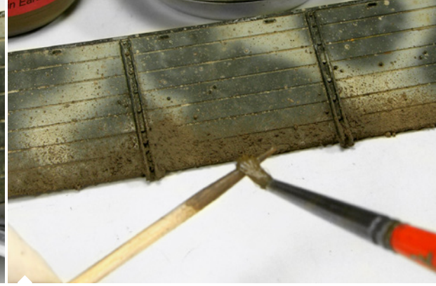
To obtain adhered soil use a stiff brush and a toothpick (you can also use the airbrush). Projecting the mixture to get the splash pattern. It is worth practicing on paper until you get the desired effect.