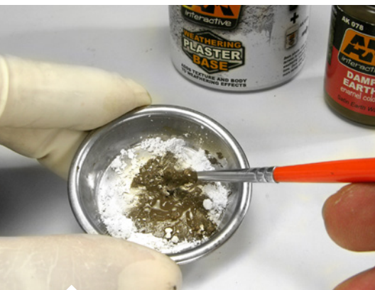
We apply the product directly from the jar on a well. Add plaster and stir with the brush to give a rough and coarse texture.